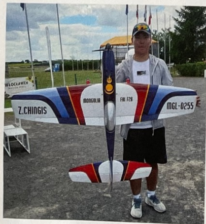
18 AeroModeller 1026 – November 2022