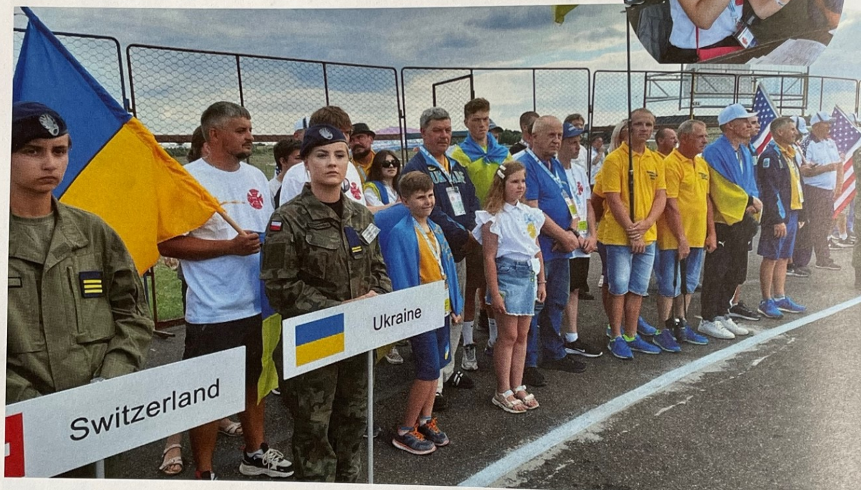
Fabulous photos by Bogdan Wierzbza taken at the Opening Ceremony and across the F2 classes, together with full results for Combat F2D and other classes, can also be found on the website cl-f2abcd-wchs2020.pl