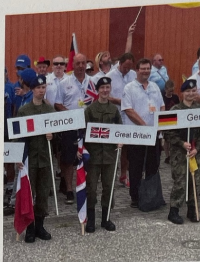
A parade of the teams and entertainment marked the opening of the CL World Championships.