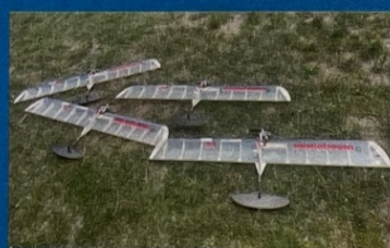
Bill Maywald's carbon boom models from the States. He says there is about $200 of carbon in each model because of the moulded carbon leading edges. Lovely to fly but the boom is very vulnerable.