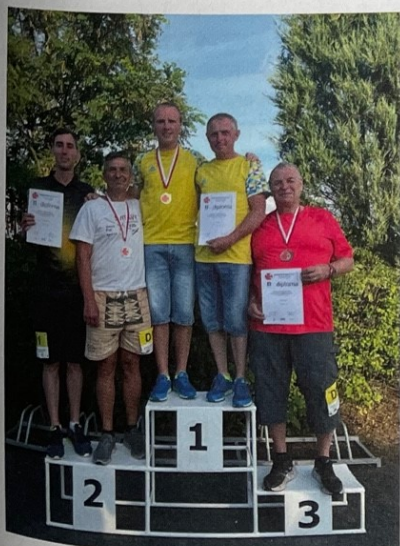
The World Cup F2T Combat podium of winning pilots and the Ukrainian and Lithuanian team mechanics.