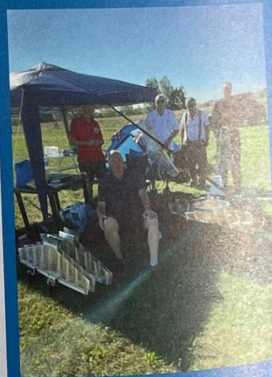
The British team unpack their F2D models after the long journey to Warsaw in Poland.